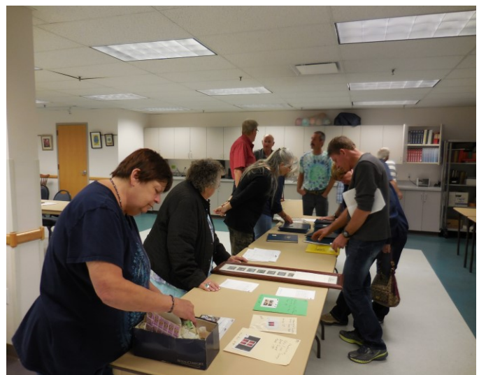
Members view various items at Stamp Club Auction