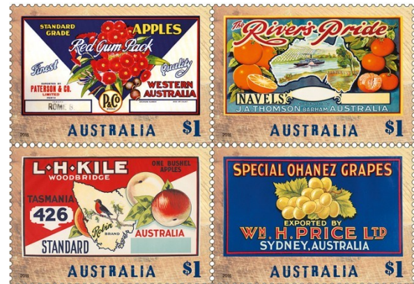
One of three sets

The stamps displayed are from the largest public collections of Troedel Printing Archive containing an amazing array of colorful designs. The fourth stamp shows the Western Australian label for Paterson & Co.