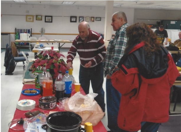
Stamp Club Christmas Party December 15, 2016