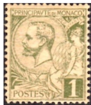
Prince Albert I