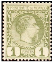
Prince Charles III

Remember the stamp show on the 3 rd and 4 th of February at the Sons of the Utah Pioneers. See you at our next meeting! ##