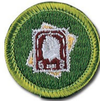
Stamp collecting Badge