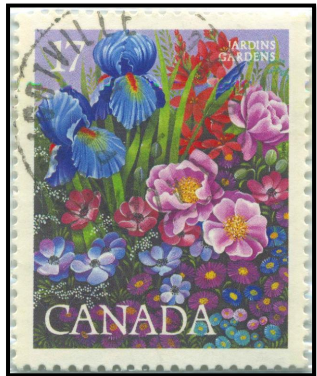
CANADA Jardins Gardens