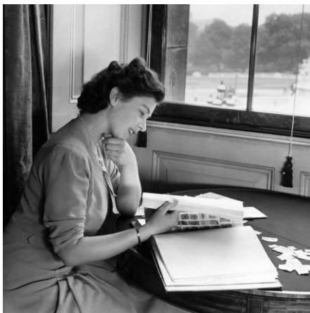
Queen Elizabeth at a young age looking over her stamp collection. #