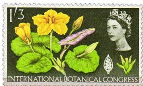
England – Botanical, a set of 4