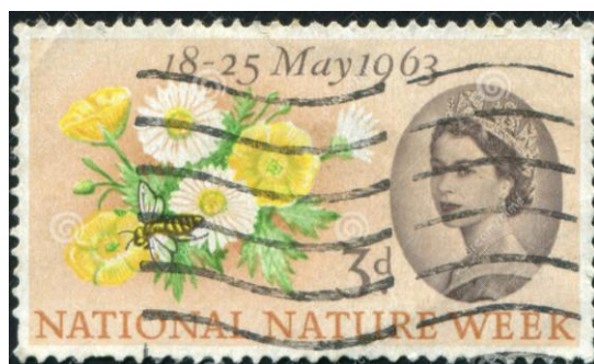
National Nature Week, May 18-25, 1963