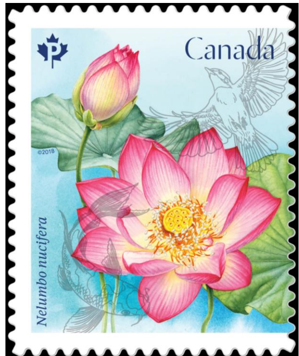
CANADA Nelumbo Nucifera