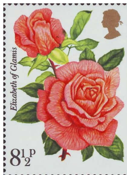
ENGLAND Elizabeth of Glamis