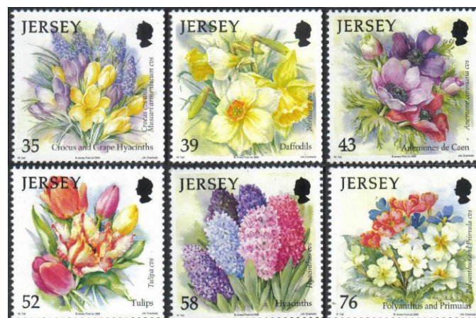
ENGLISH Jersey with Queen silhouette